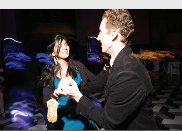
The Annual Violet Ball was held Feb. 26 in the atrium of Bobst Library on the undergrad campus. This year's event sold fewer tickest than normal to minimize crowding. The guest list was limited to 900 students so there was room to boogie down.