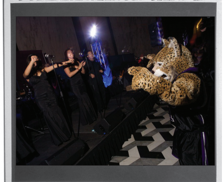
The NYU mascot dances the night away at the annual Violet Ball. See page 3 for two more pictures and even more details.

Role Play isn't just a segment on Pardon the Interruption.